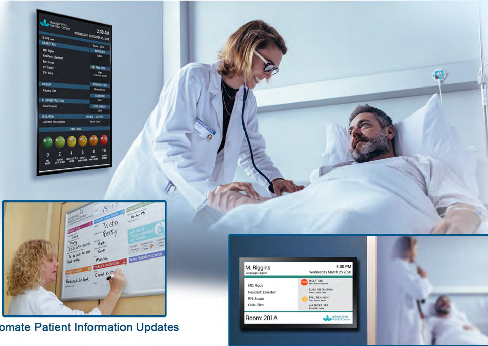
Automate Patient Information Updates